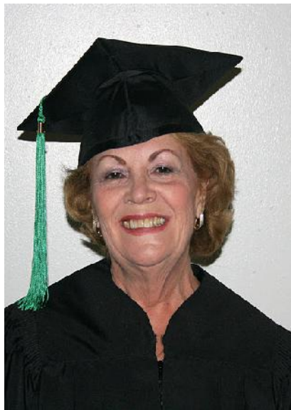
Our newest College of Regents