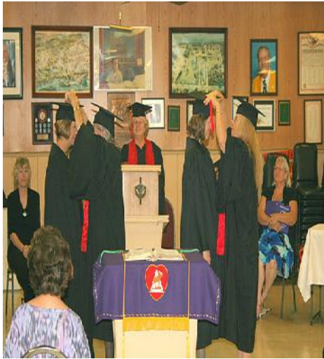
Changing of the Tassel