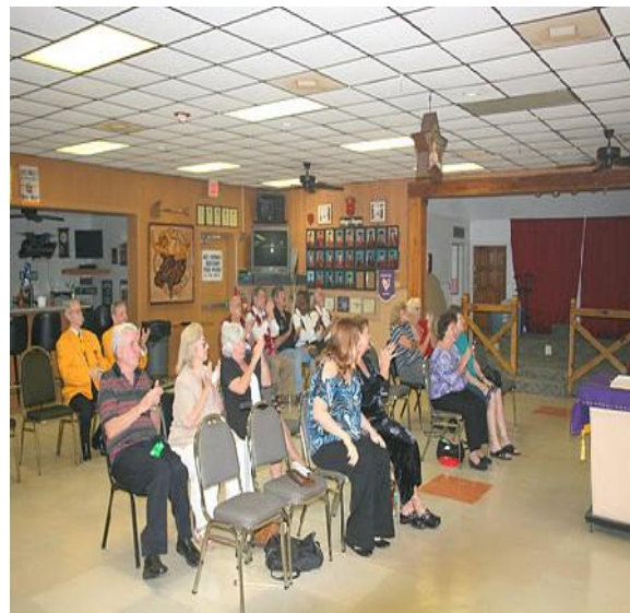
The College of Regents Chapter Night