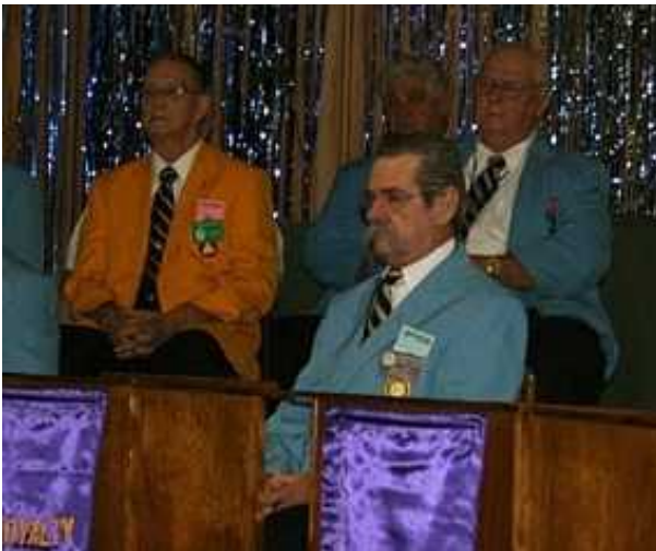
Larry Wilkerson became a Fellow this year.