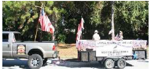
Veteran's Day Parade, LOOM 1741, WOTM 1763, Moose Riders and our Boy Scouts participated.