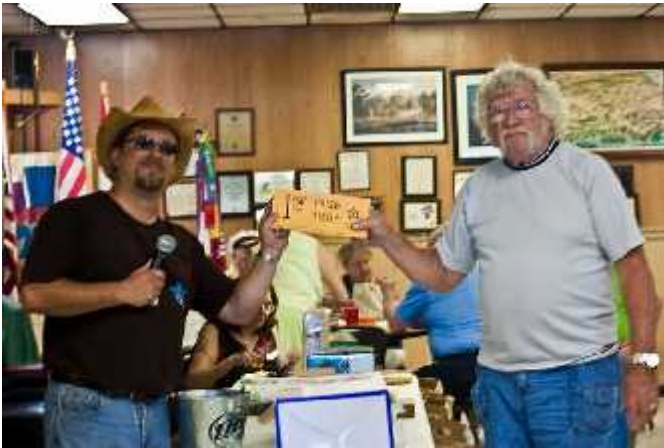
Moose Riders First Bike Show