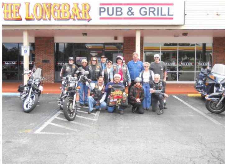
27 th Annual Vietnam and Legacy Vets Toy Run 2011 Thank you Moose Riders