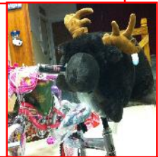
"Moose on Bike" it's a Moose pillow pet

Here are the gifts with an estimated value of about $2,000 that were purchased by Martha, Misty and our members who either donated blood at Wal-Mart and received a $10 gift card and donated that back to this fundraiser, or members chose an angel from the tree in our Social Quarters with the needs of each child on the angel. Some groups of members shared an angel and purchased the gifts for that child. And lastly, donations from the Christmas ornament hang-ups were used to purchase toys for the children that were not selected from the tree. We were able to provide gifts for 25 children in the foster care system. This resulted in nearly 52 hours of Community Service. Special thanks to everyone who worked and participated in this project. We appreciate Martha taking the time to bake and paint the Gingerbread hang ups too. Thank you all for your support.